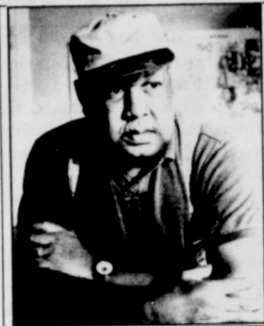
Ernest J. Gaines, author of The Autobiography of Miss Jane Pittman and A Gathering of Old Men

munity in the late 1940s, a young black man named Jefferson is a reluctant party in a liquor store shoot-out in which the three other men involved are all killed, including the white store owner. Jefferson, the only survivor, is accused of the murder. At the trial, the essence of the defense is that