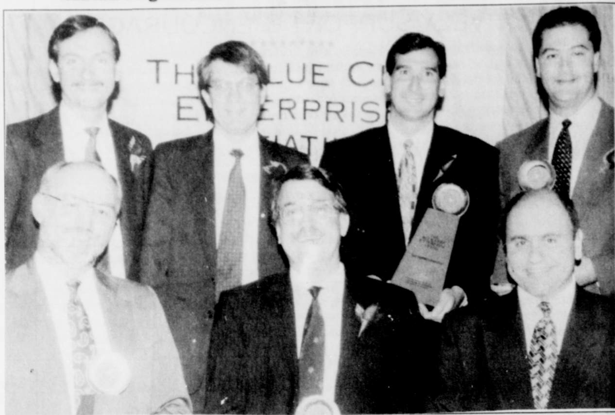
The companies comprising Oregon's "Blue Chip Enterprises" are Advanced Information Systems, Inc. of Lake Oswego; and Chown Hardware, The Empire Company, and The Trail Blazers, Inc., all of Portland.

National Program Enables Small Businesses To Share Success Stories