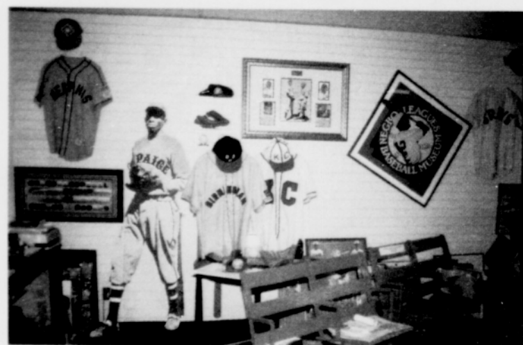
Negro League Baseball Museum