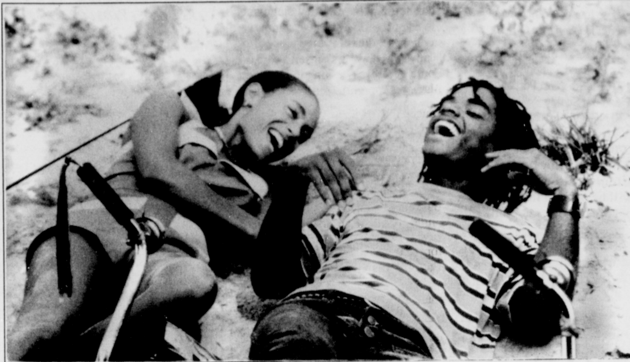
When shy and timid teenager Drew Tate (Larenz Tate, right) meets the bold and beautiful Lauren Kelly (Jada Pinkett, left) while vacationing with his family on Martha's Vineyard, he discovers he's not as awkward around girls as everyone thinks, in Touchstone Pictures' new coming-of-age comedy/drama.

A Touchstone Pictures presentation, "The Inkwel" is di-