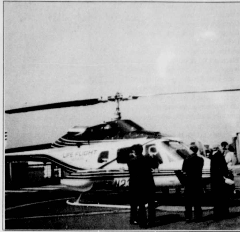
The new Bell 230 helicopter

"The new helicopter will be fully equipped as a flying critical care and coronary care unit, and it will accommodate two patients the same as Life Flight's current helicopters," says