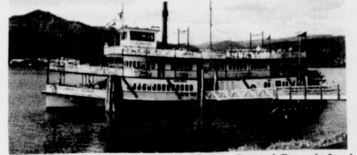
Sternwheelers owned and operated by the Port of Cascade Locks

SPECIAL SENIOR RATES: On Wed. & Thurs. Seniors are only $7.95 Reservations required on meal cruises. Please call for schedules or more info. 223-3928 Ext. 141