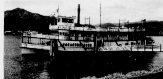
Sternwheelers owned and operated by the Port of Cascade Locks

Reservations required on meal cruises. Please call for schedules or more info. 223-3928 Ext. 141