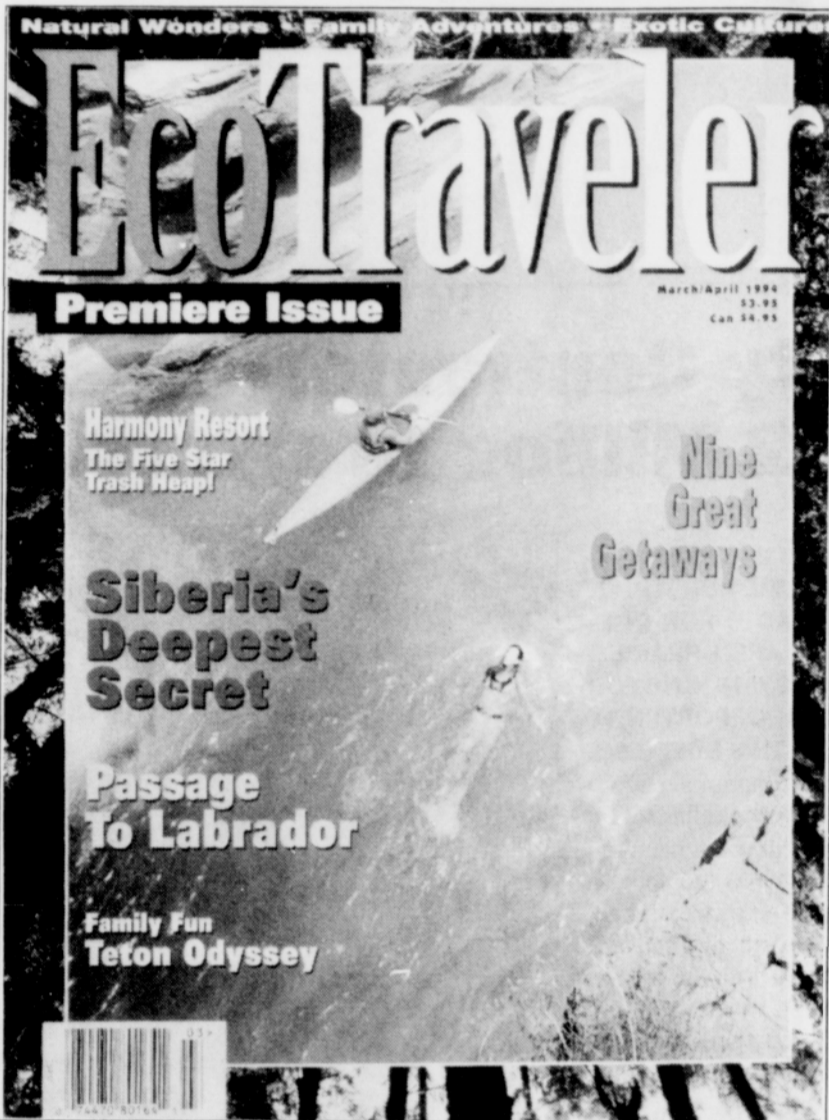
Cover For EcoTraveler Magazine

EcoTraveler will be distributed via subscriptions, newsstand sales, direct mail and travel consumer expos, with an initial circulation of 150,000. Newsstand price will be $3.95 per issue and the 12-issue subscription price is $19.95. To order a subscrip-