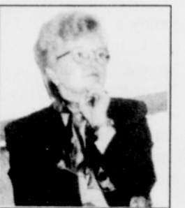
Governor Barbara Roberts