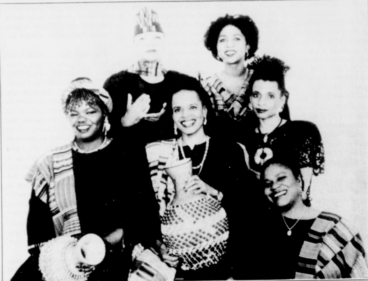
(From left to right) Shirley Childress Johnson • Bernice Johnson Reagon • Nitanju Bolade Casel • Aisha Kahlil • Ysaye M. Barnwell • Carol Maillard.

Sweet Honey In The Rock Coming March 19th