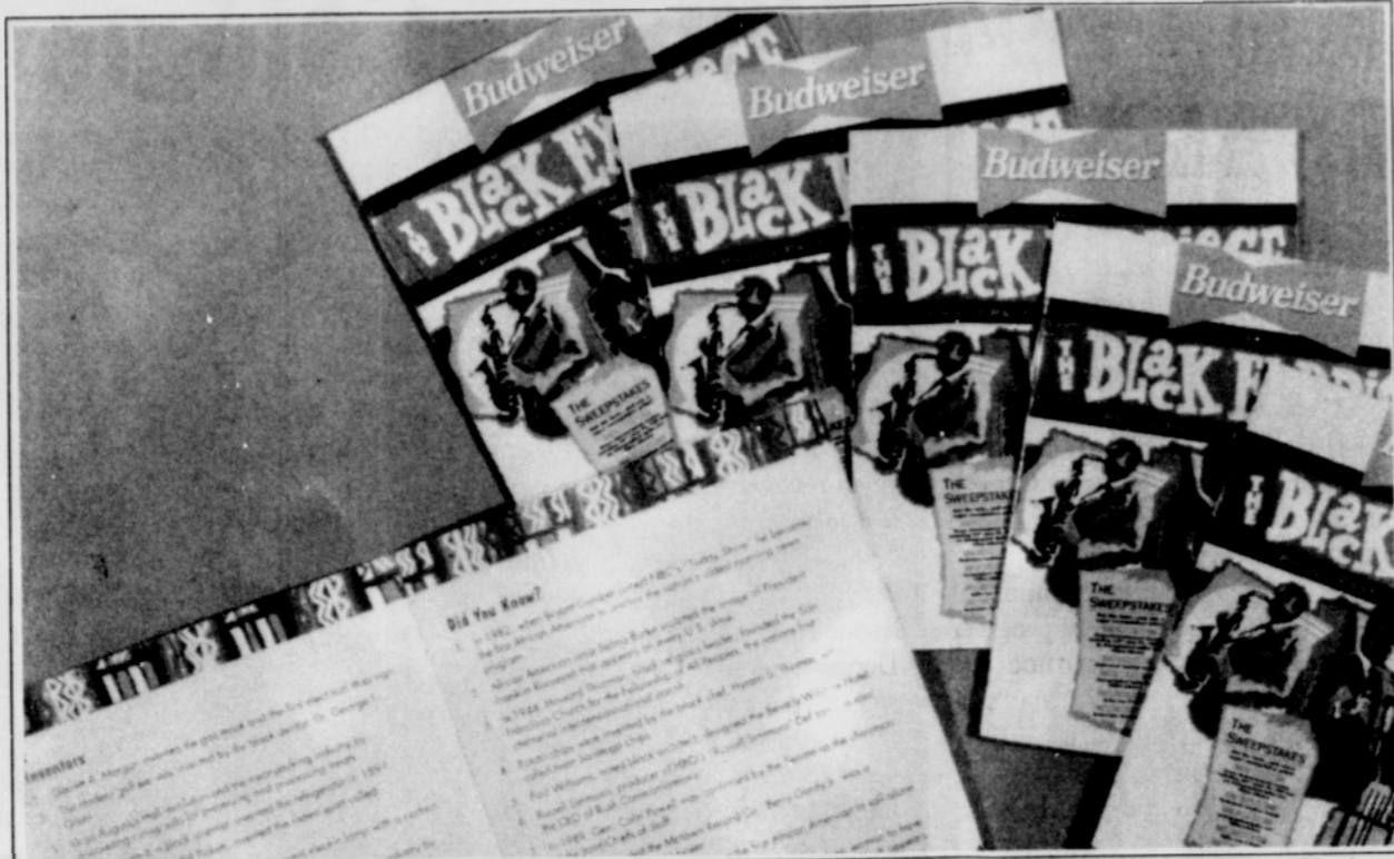
Budweiser Salutes The "Black Experience" During Black History Month--The Budweiser Family will salute Black History Month this year with its "Black Experience" sweepstakes. The Sweepstakes will include a "take one" fact booklet that recounts some of the achievements of outstanding African Americans in literature, science, industry, education and sports. Consumers can enter the Black Experience Sweepstakes by completing the entry blank located on the booklet. The grand prize for the sweepstakes is a Home Entertainment Center, featuring a 35" color television, VCR and an autographed library of famed director Spike Lee's films.

Consumers can enter the contest by filling out an entry blank