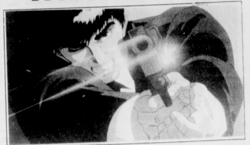
A Character In Wicked City

Wicked City is a stylish, graphic, psychosexual thriller from Youshiaki Kawajiri. Considered one of Japan's most up-and-coming animation film makers, Kawajiri's other works include LENS MAN, the "Running Man" segment of NEO-TOKYO, GOKU: MIDNIGHT EYE and CYBER CITY O.E.D.O.808. In LENS MAN (1984), his directorial debut, Kawajiri was the first to use extensive computer-generated graphics in an animated feature. Kawajiri told Animation Magazine (Summer 1992) he wanted to create something that adults could enjoy. He wanted