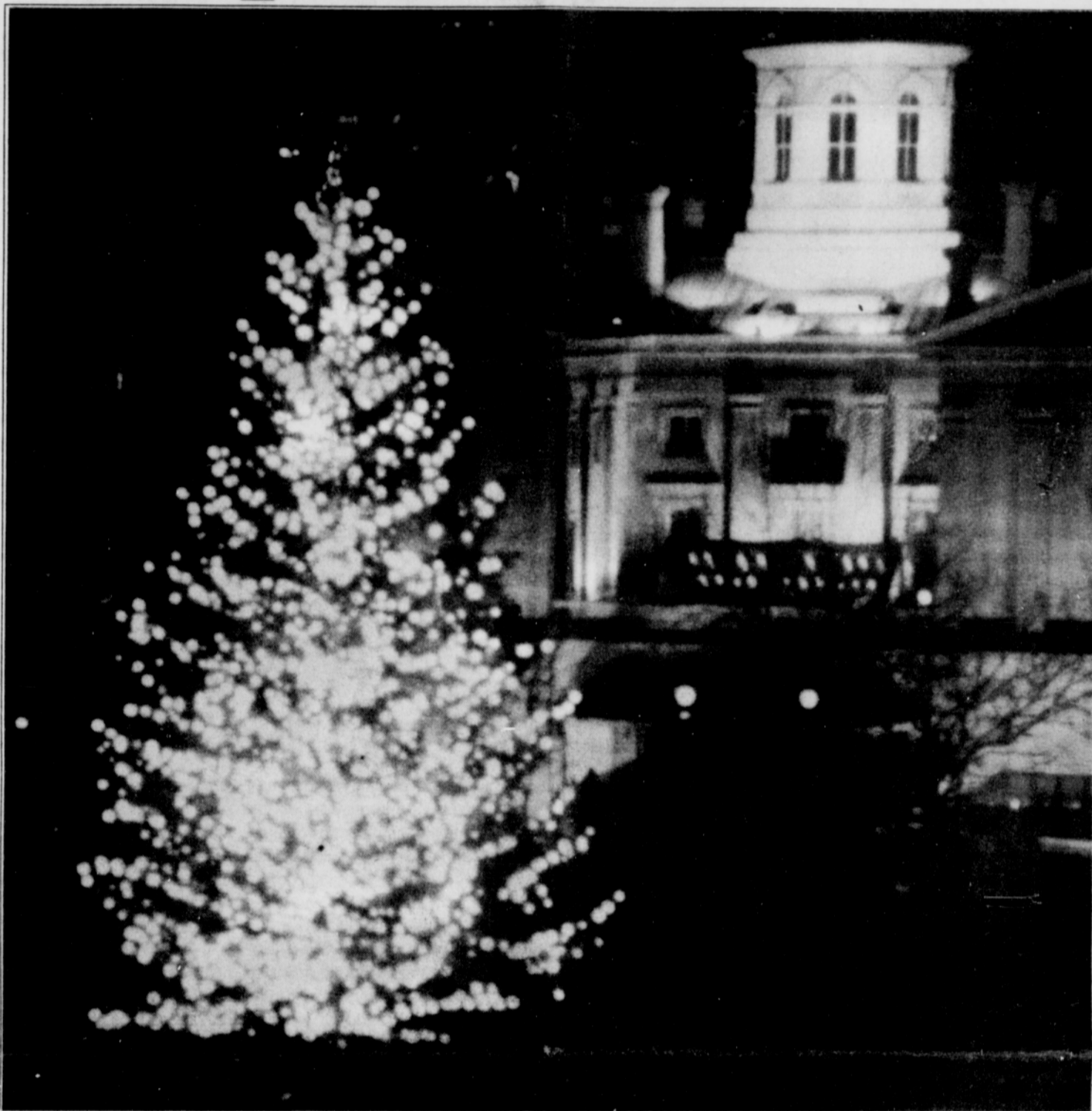
Pioneer Square Celebrated the lighting of their seventy foot Christmas tree