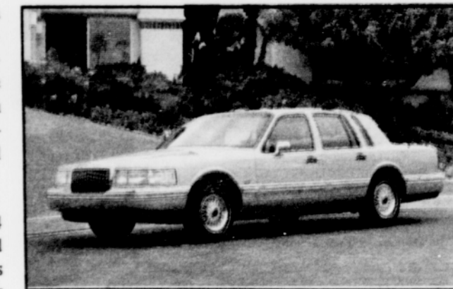
LINCOLN TOWN CAR

MERCURY VILLAGER - The new minivan gets a standard driver-side air bag, CFC-free air conditioning and a new battery saver feature.