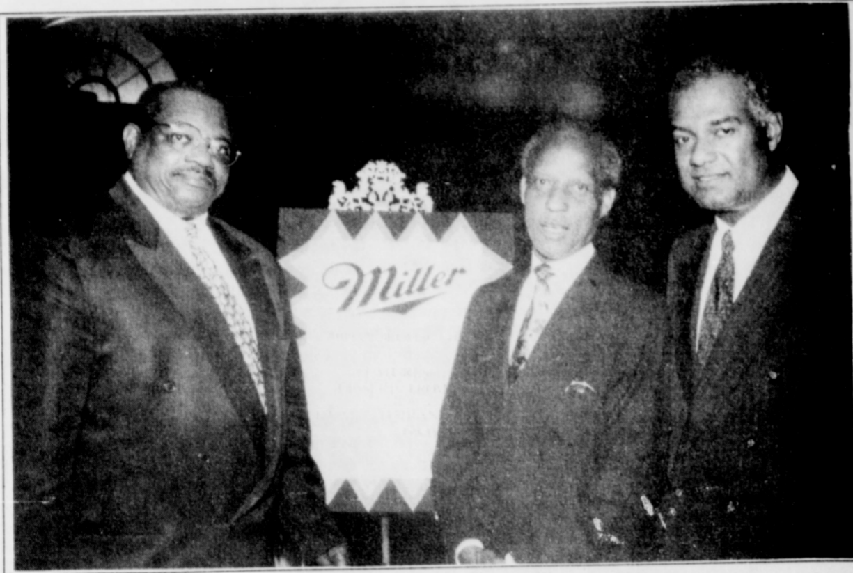
Life got very sweet indeed for guests attending a dessert reception sponsored by Miller Brewing Company as part of the recent