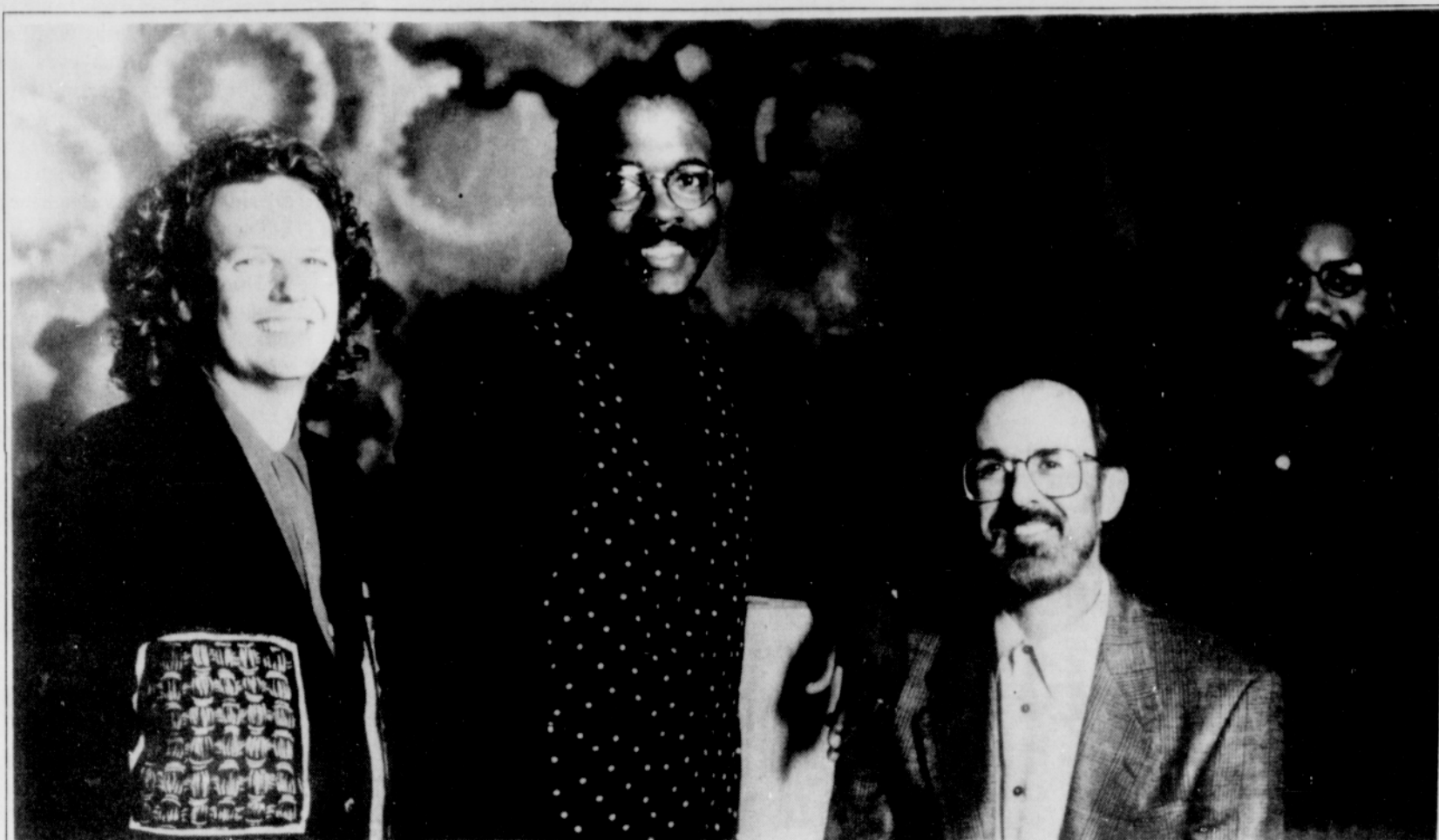
The "Fourplay" musicians

Produced by Fourplay. Between The Sheets features eleven new cuts, including the title track, with a vocal duet by Nathan East and special guest Chaka Khan, as well as such standout selections as Neil Hefti's "Li'l Darlin'," the