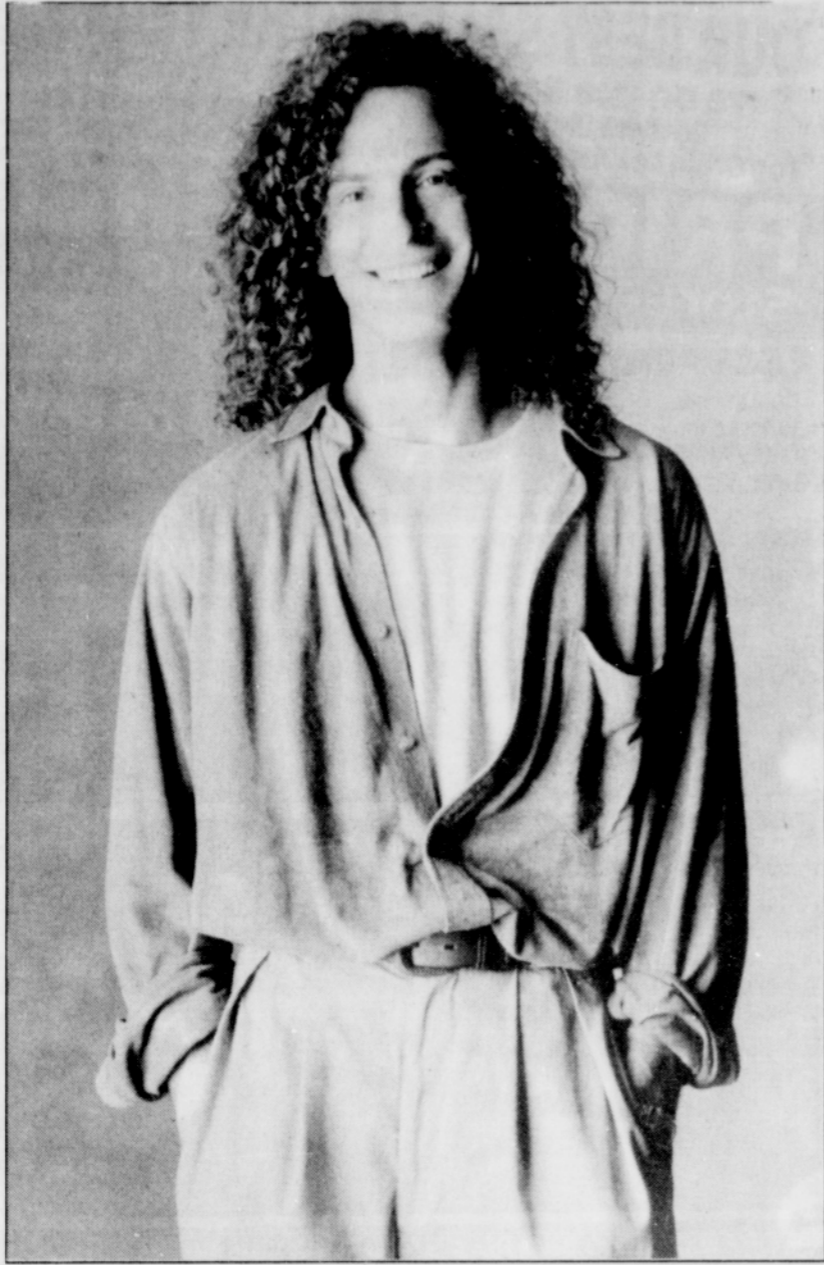
Kenny G, Jazz Musician

Breathless , Kenny's first album in four years, was largely recorded and mixed in his new home studio, Studio G. According to Kenny, the key to his success is the inspiration he gets while playing at home. "I look outside and if it is raining, the song will be something that has to do with rain. When I come here, it is a safe haven for me, it's like an oasis." Breathless , 14-song album, including the debut single "Forever In Love," showcases Kenny's talents on a variety of saxophones in addition to handling keyboard and drum programming. "This album is in my opinion my best work to date and a reflection of the growth and changes that I have made and experienced as a musician and as a human being during the last four years." Other trademark instrumentals on the album include "Joy Of Life," "Alone," "Morning," and "The Wedding Song" which this album, Kenny adds Peabo Bryson ("By The Time This Night Is Over") and Aaron Neville ("Even If My Heart Would Break") to his distinguished list of vocalists he has worked with over the years (Aretha Franklin, Whitney Houston, Smokey Robinson, Natalie Cole, Dionne Warwick,