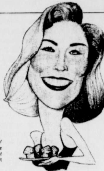
Sharon Stone's acting credits include a Sprite TV commercial, the TV series Bay City Blues and the movie Total Recall. But she is probably best remembered for her starring roles in Basic Instinct and this past summer's hit thriller, Sliver.

2 cups flour 1 tablespoon poppy seeds 1/4 teaspoon baking soda 1 cup sugar 1/2 cup unsalted butter 2 eggs 1 teaspoon vanilla 1 teaspoon shredded lemon peel 1 cup plain yogurt