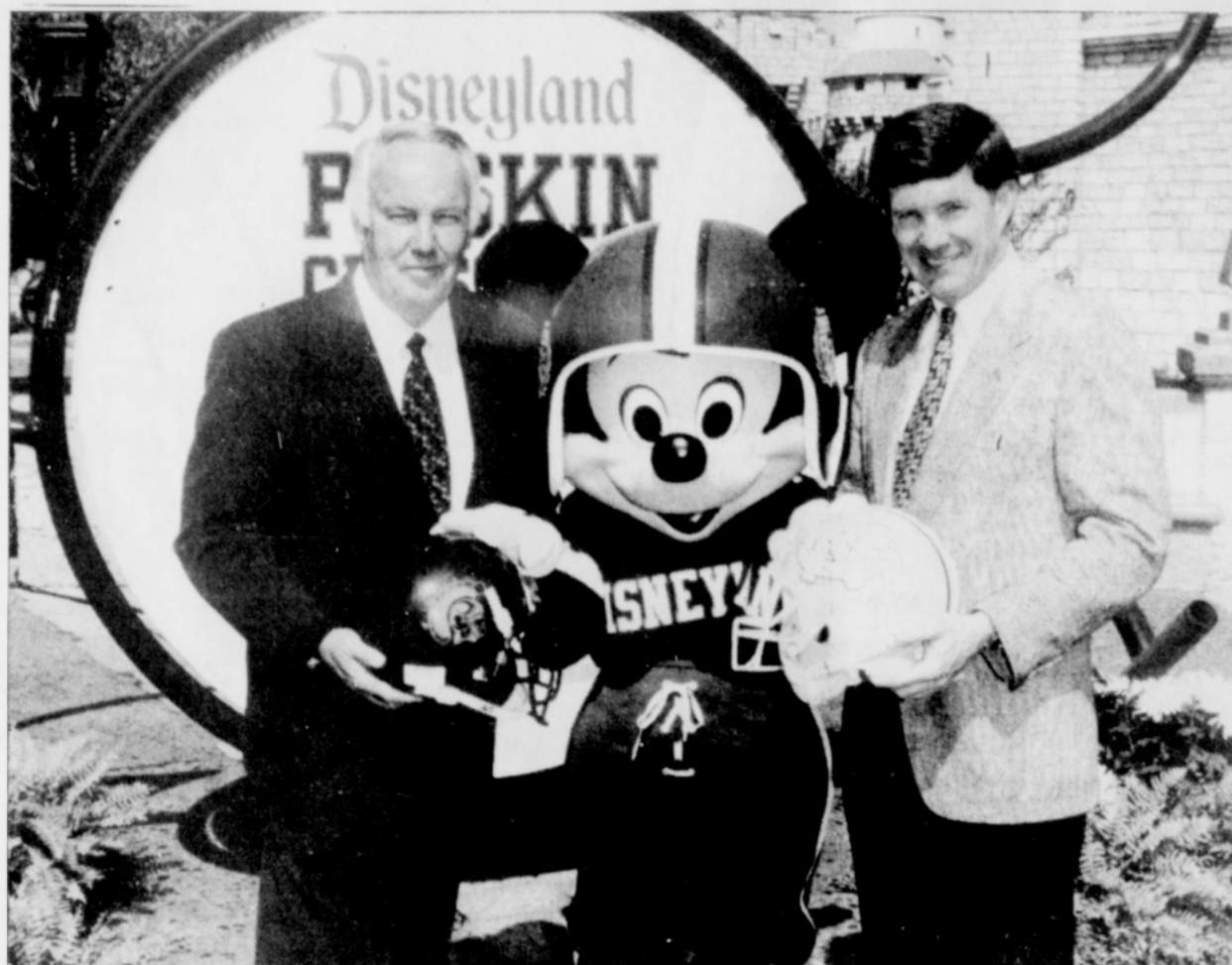
Rivals At Pigskin Classic IV--University of Southern California head football coach John Robinson (L) and North Carolina head football coach Mack Brown (R) joined Mickey Mouse at Disneyland for the official announcement, March 1993, of team selection for the fourth annual Disneyland Pigskin Classic. USC will play Carolina on August 29 at Anaheim Stadium in the first game of the 1993 season for either team.

The two schools have produced forty 1000-yard rushers between them, with North Carolina having 21 and