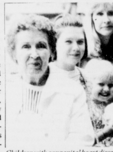
Children with congenital heart disorders and their parents celebrated summer with a picnic

Children with congenital heart disorders and their parents celebrated summer with a picnic at Oaks Amusement Park, Sunday, July 11th.