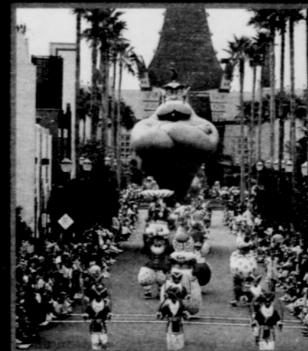
Aladdin's Royal Caravan