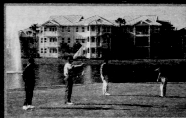
One of Disney's 5 Championship Courses