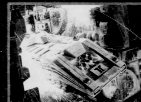
Star Tours (Presented by 20th Century Fox)