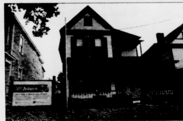
Dr. Martin Luther King Jr.'s house.

Sweet Auburn Historic District: Auburn Avenue. From the 1880's through the 1940's "Sweet Auburn" was the thriving center for Black enterprise. Dubbed "Sweet Auburn" in the 1930's because "money flowed like honey" it was known as the "Richest Negro street in the world". Home to landmark churches and Black businesses..