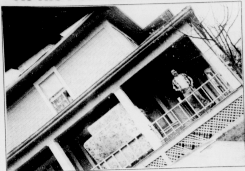
Photo Exhibition By Gang- Affected Youth Opens June 10 At The Portland Art Museum

gang-affected youth will be on view at ing with the youth in the classroom the Portland Art Museum, June 10th and on-location shoots. through July 5th, in the Museum's Sculpture Court.