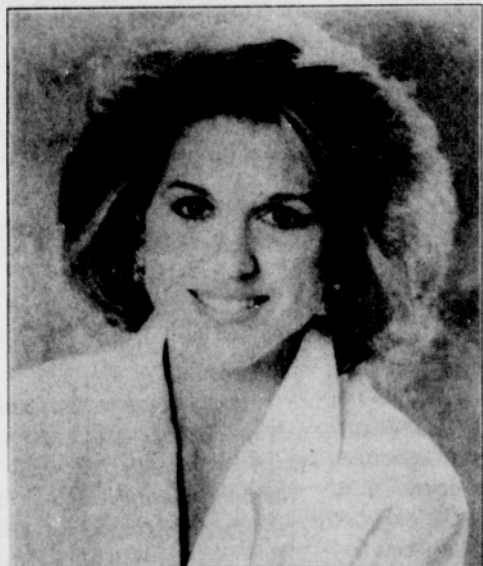
Paula Zahn at left