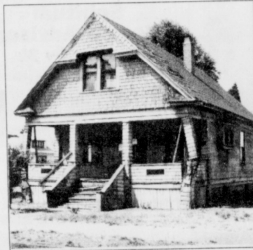
Before and after photos of a successful home repair loan project — one more family showing neighborhood pride.

Your chances of qualifying for one of these City loans are good if you own your home, need city-approved repairs or improvements, and have a qualifying income.