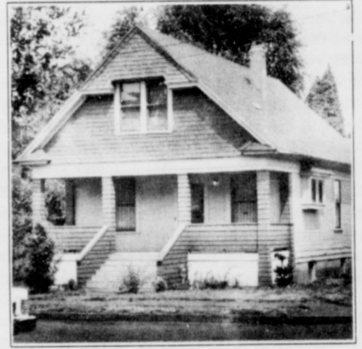
Before and after photos of a successful home repair loan project — one more family showing neighborhood pride.

If you have questions, or would like to find out if you qualify for a loan, call PDC's Eastside Neighborhood Housing Preservation Office at 823-3400, Monday through Friday, 8 a.m. to 5 p.m. Remember, City funds are limited for this program, so call today to begin enjoying the benefits of your home repairs.