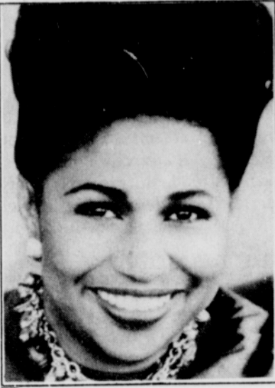
Senator Carol Moseley Braun