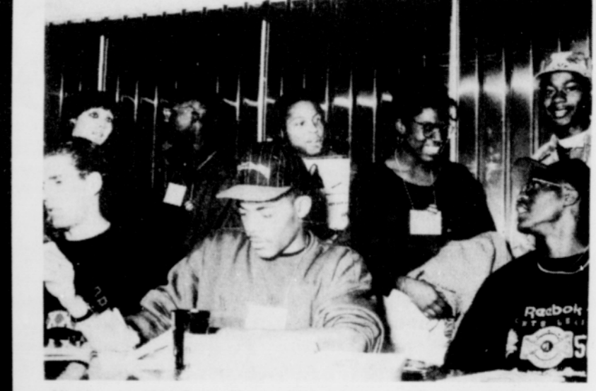
Visiting the 1993 Super Show exhibit as guests of Reebok and the ABSG, Atlanta youths had an opportunity to meet Atlanta Hawks (l to r), Jon Koncak, Duane Ferrell and Dominique Wilkins

ATLANTA, GA -- In an effort to expose minority youth to career opportunities available in the athletic footwear and sporting goods industry, Reebok International Ltd., and the Association of Black Sporting Goods Professionals (ABSG), played host to a group of high school age youths from the City of Atlanta as they toured the 1993 Super Show exhibit held recently at the Georgia World Congress Center.