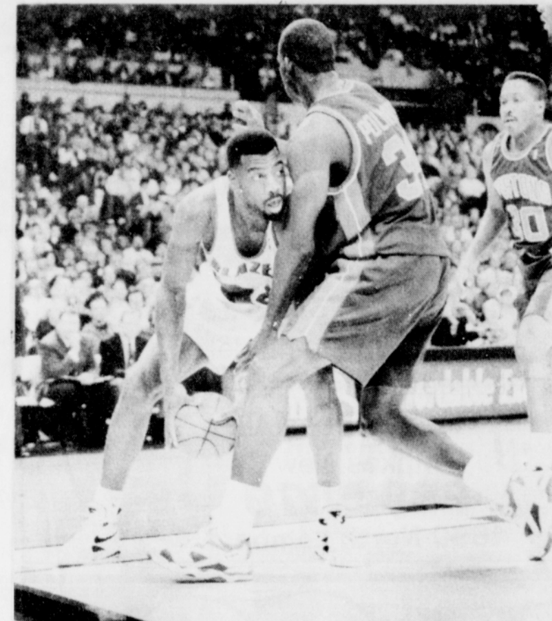
You can see Mark Bryant this Sunday at the Midway Shopping Mall from 1:00pm to 4:00pm at the Portland Saints Auction. Bryant along with Mario Elie, Rod Strickland, Dave Johnson and Tracy Murray will be there to sign autographs.

The U.S. National Senior Sports Organization will hold its biennial competition, the Senior Sports Classic, June 12-18, 1993, in Baton Rouge, La. You can get more information on attending the games by calling 314-878-4900.