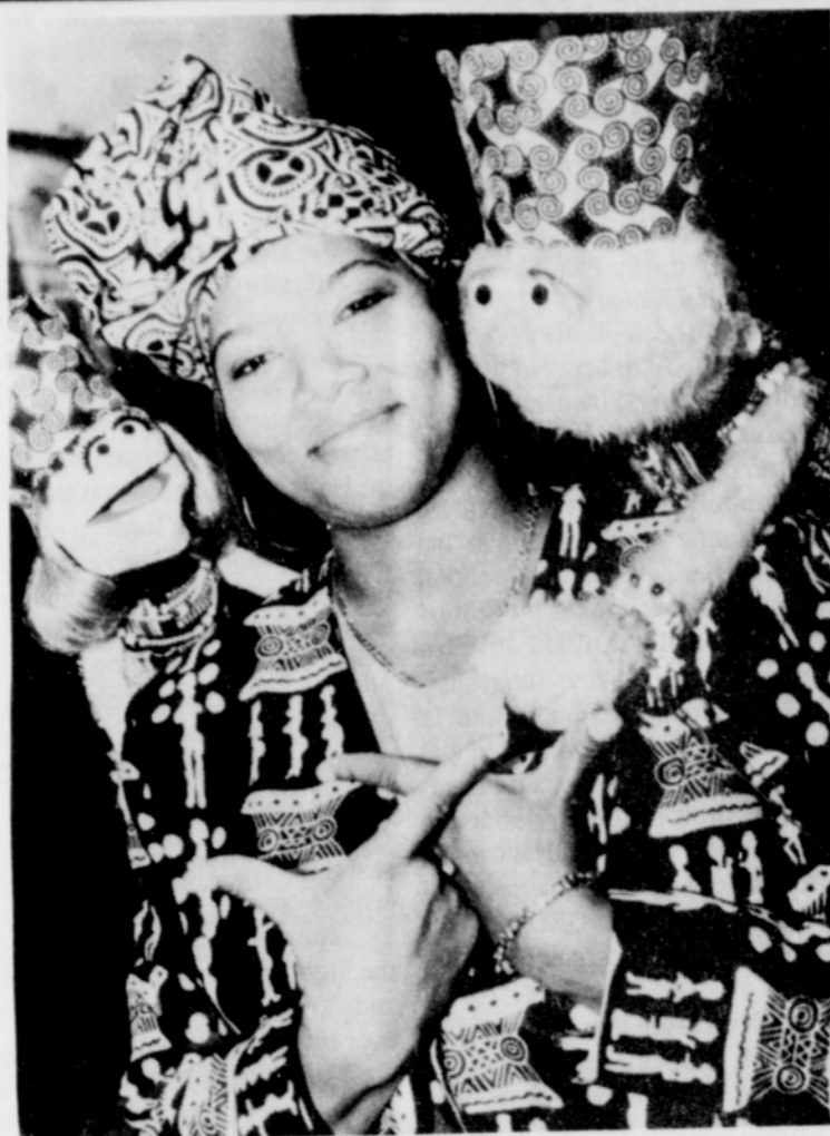
Hangin' with Homegirls: Rap star Queen Latifah joins her Sesame Street Safari Sisters (l to r), Prairie Dawn and Merry Monster, as they search high and low for the missing letter "O". Latifah's performance with the muppets airs on Sesame Street February 1 on PBS (Check local TV listings.)

The success of her first single, "You Remind Me," has given Mary a strong foundation. Track after track, her irrepressible, free-style should smoothly blends together messages of love and romance with a deeper hip-hop vibe. "When I sing, I sing from my heart and soul, and when I perform, I want my audience to know that I really believe in what I'm singing, and to feel the soul that I feel." Mary's natural diversity and innovative style make her a trendsetter in the music world. Her ability to combine soulful, classic R&B with the raw energy of hip-hop makes her a timeless artist who will no doubt bridge many of the generation gaps in black music.