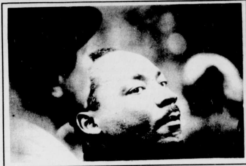
Martin Luther King, Jr.

Today we remember Martin Luther King, Jr. for his powerful words and actions.