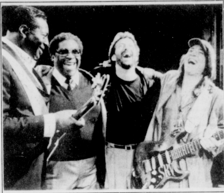
A Gala Blues Affair

Harmonica player Paul Butterfield was the leader of his own popular '60s band and has played with Bob Dylan