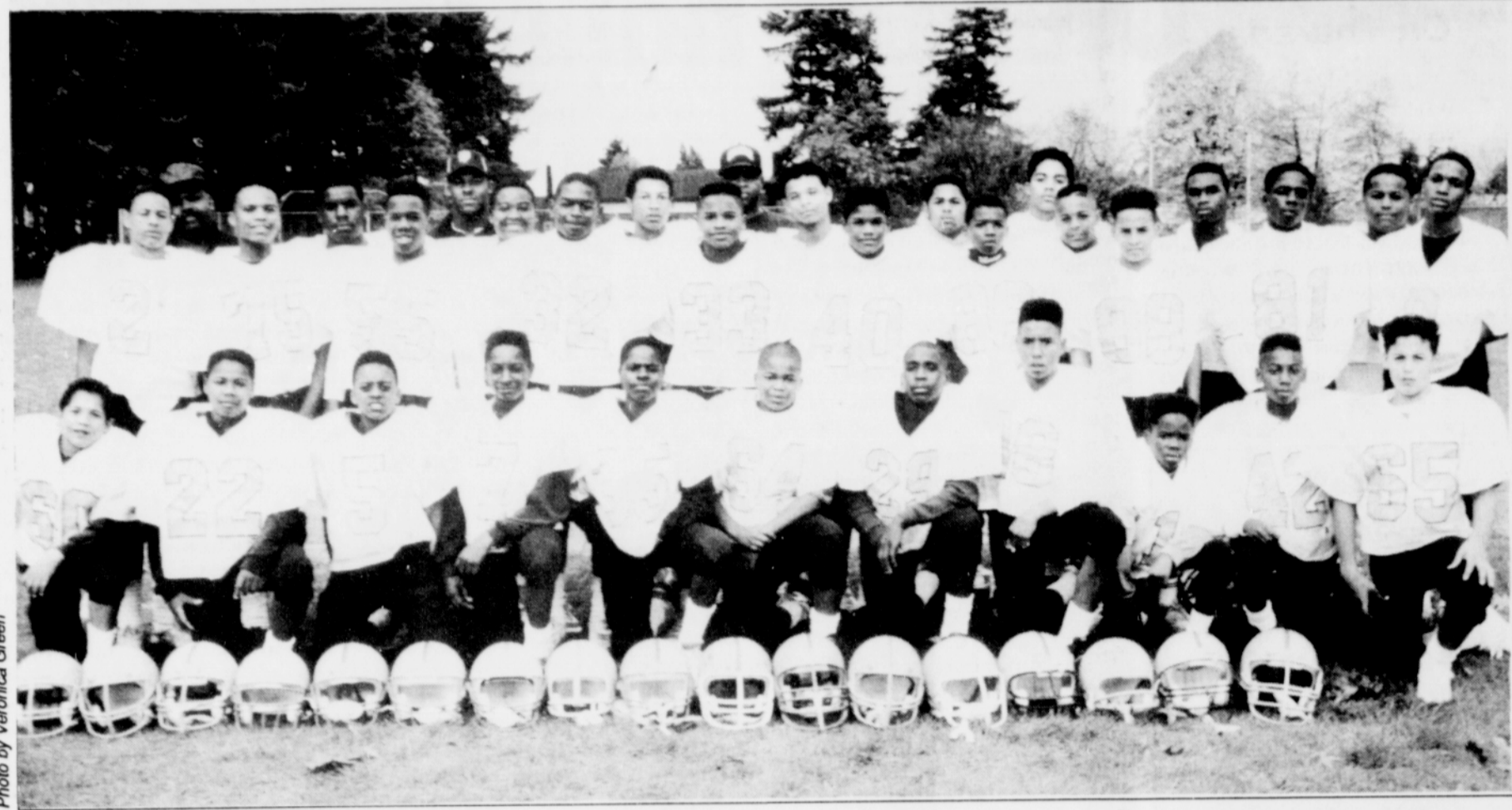
Jefferson's 7th and 8th grade Pop Warner football team captured the city Championship by crushing Franklin 46-0 last Saturday Night at Walker Stadium. Congratulations Jefferson.