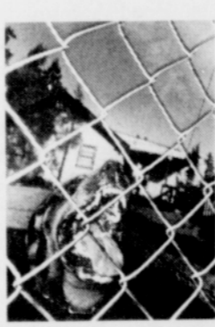
Nothing helps deter crime like a highly-visible, well-organized neighborhood patrol program. Nothing

To Fight Crime In Your Neighborhood, We Suggest Building Bridges, Not Fences.