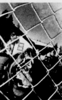
Nothing helps deter crime like a highly-visible, well-organized neighborhood patrol program. Nothing

The School Tool, which sells for $5.95, is available at local bookstores and from Portland School District's Public Information Office at 249-3304. Copies also are available by calling the authors at 281-2947 or 284-1880.