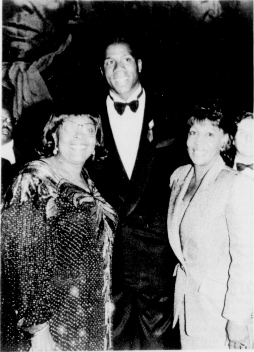
"Magic" Honored By CBCF--Earvin "Magic" Johnson, center, Los Angeles Lakers basketball superstar is welcomed to the Congressional Black Caucus Foundation's (CBCF) 22nd Annual Awards Dinner in Washington, D.C. recently by Rep. Cardiss Collins, (D-I1), left, and Rep. Maxine Waters, (D-Ca). A partner with "Black Enterprise" publisher Earl Graves in Pepsi-Cola's $60-million distribution business in Washington, Johnson was one of six Americans to be honored by the Foundation. The CBCF's citation noted Johnson's fund-raising efforts that netted $7.5-million in