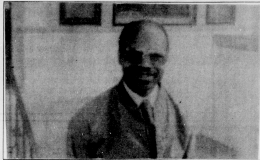
BY CLEO FRANKLIN

The home computer (Microcomputer) has come a long way from the days of just keeping track of phone numbers and recipes. Microcomputer has far more useful task in today's home. Some good examples include but not limited to the following.