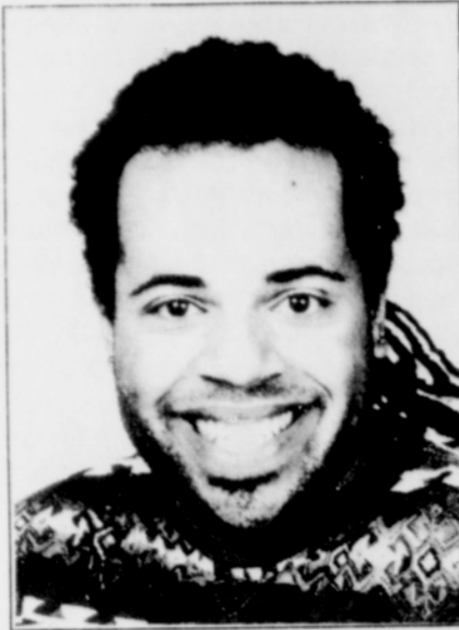
Gus Van Sant