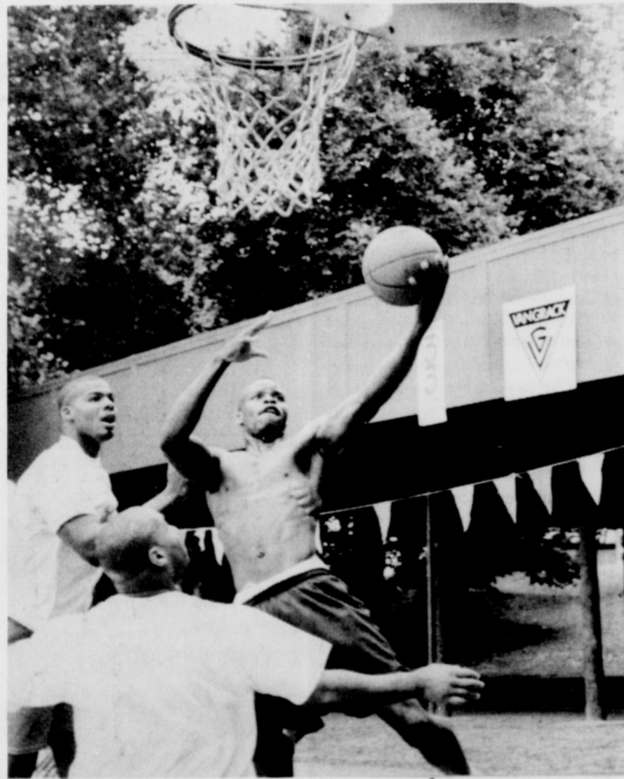
BY JOHN PHILIPS