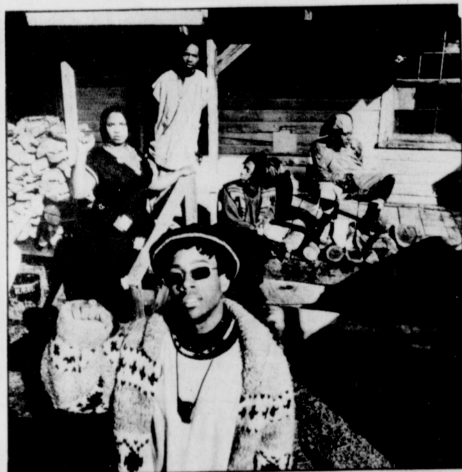
Will be in Portland Aug. 7. Showtime, Roseland Theatre. For tickets please call 224-8499 don't miss it! Arrested Development is one of the hottest groups around (wow that's entertainment).

PORTLAND OBSERVER "The Eyes and Ears of the Community" Office: (503) 288-0033 Fax #: (503) 288-0015