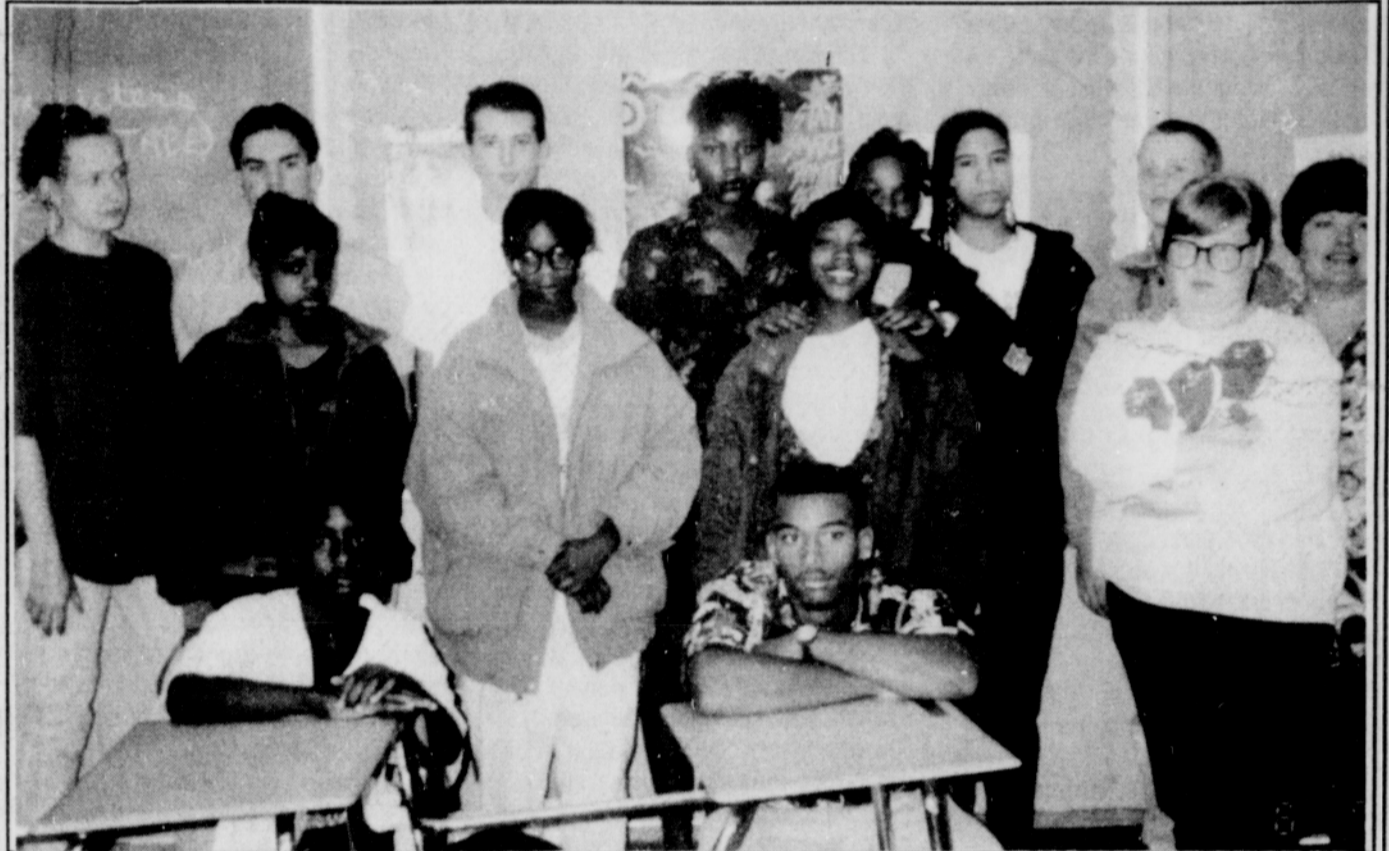
Those above are participants in the Jefferson High School Step Program. STEP is a nationwide program, created for low-income children. It is now in over 100 cities. Serving children between 13-16 years old. The program has been in existence since 1985. STEP offers tutoring, sponsors events both social and educational and provides a stipend for those enrolled in the program. The Portland schools participating are Jefferson, Grant, Marshall, Roosevelt and Franklin.