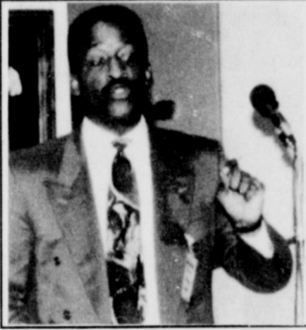
Johnny A. Gage