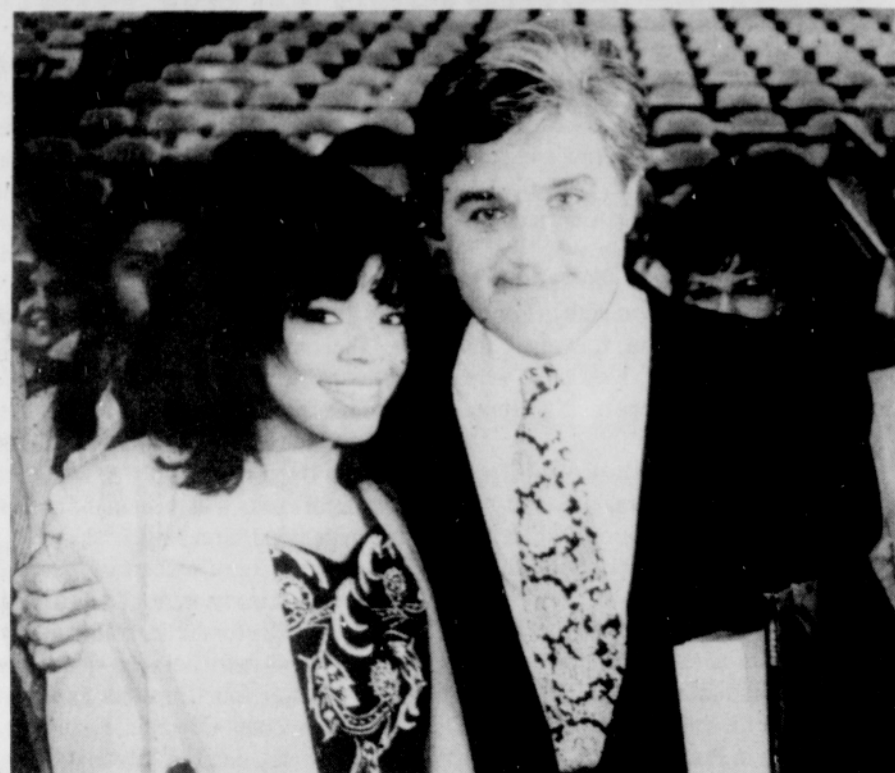
Motown's Shanice was the first-ever musical guest on the "Tonight Show with Jay Leno." Leno said, "The success of my next guest's new album, 'Inner Child,' has made her an international sensation. The first single, 'I Love your Smile,' hit the Top 10 in a dozen countries and went all the way to #1 in the U.S." Shanice performed two songs from "Inner Child": "I Love Your smile" and Minnie Riperton's "Loving you." Pictured (1-r): Shanice and Jay Leno. (Shanice/Motown our interest. Thank you.)