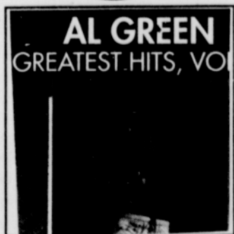
AL GREEN CASSABLANCA