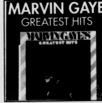
MARVIN GAYE MOTOWN