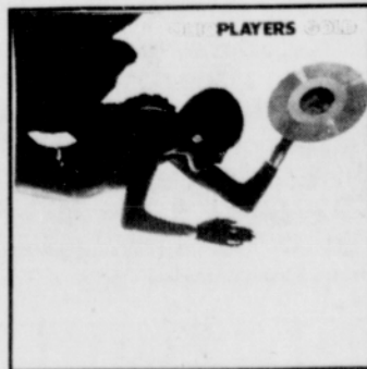
OHIO PLAYERS mercury