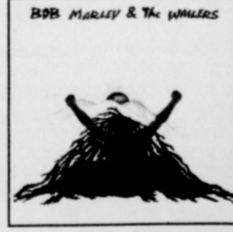
BOB MARLEY & THE WAILERS TUFF GONG