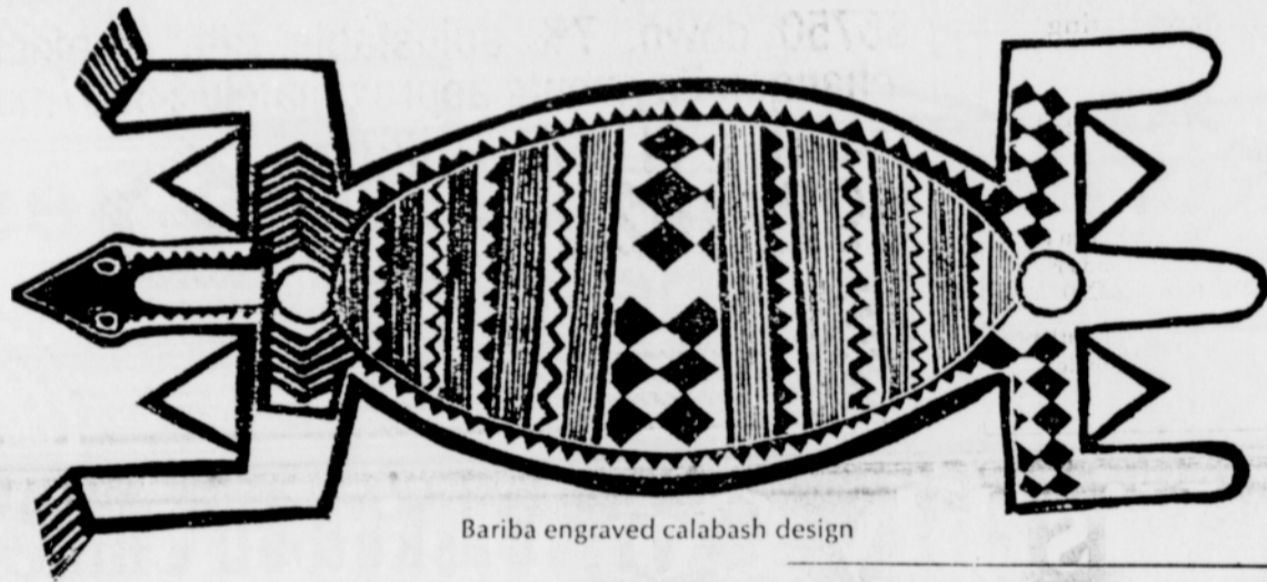
Bariba engraved calabash design

Christ is alive! Yes, he is alive forevermore!