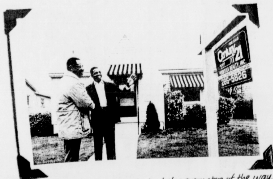
The Community Lending Center helps every step of the way.

Community Lending Center 5730 NE Martin Luther King Jr. Blvd. Portland, Oregon 97211 • 225-3751