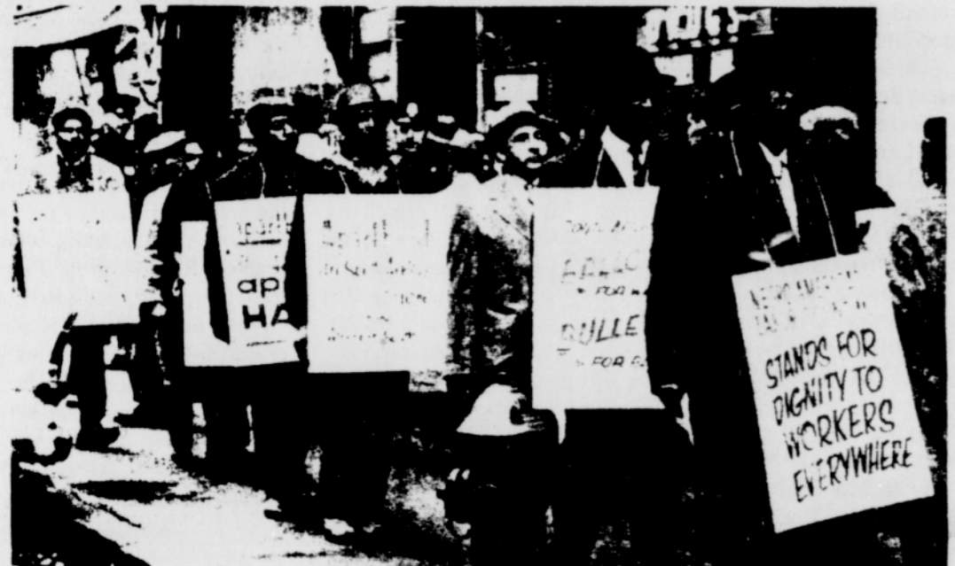
A. Philip Randolph, America's foremost Black labor leader, heads a picket line against South African apartheid