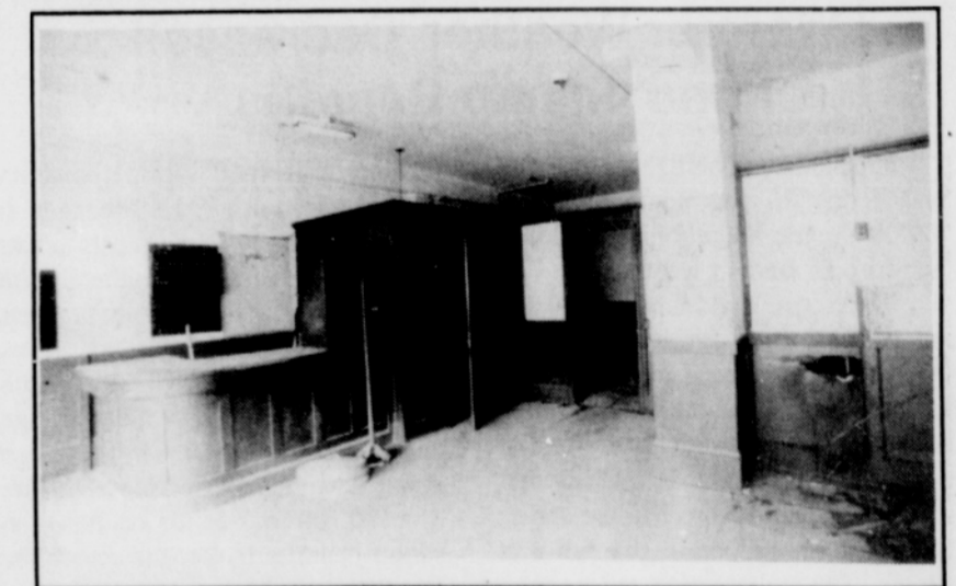
The Shoreline Building Lobby prior to renovation.