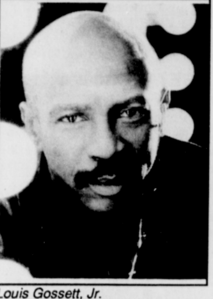
Louis Gossett, Jr.

On Thursday, Feb. 18, Academy Award winning actor Louis Gossett, Jr., will present a lecture on African-American history at the Wilson Gymnasium in Linfield College.