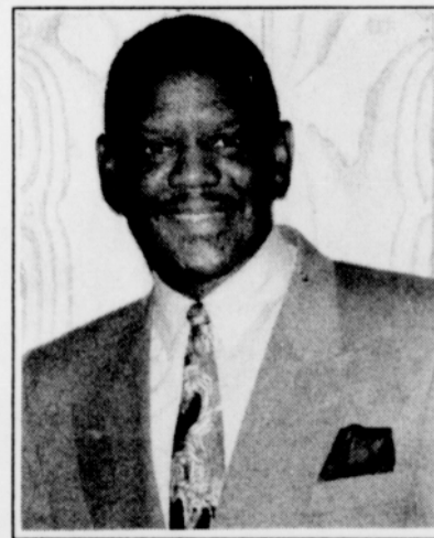
Minister Gregory Fobbs