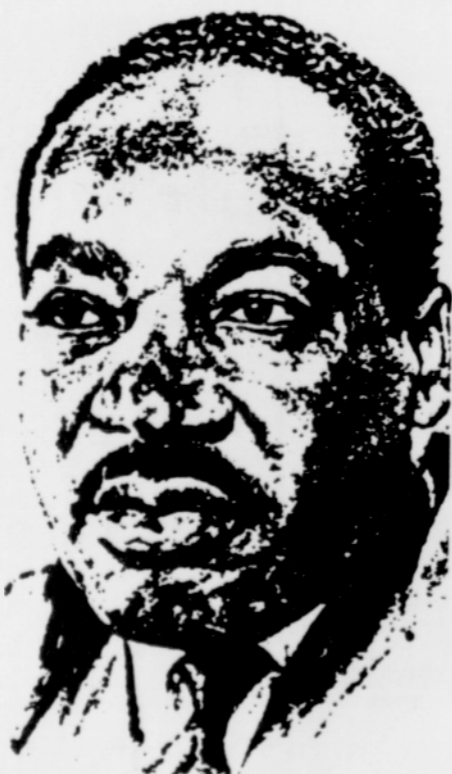
Martin Luther King, Jr. upon receipt of the Nobel Peace Prize, Oslo, Norway, 1964

"I HAVE THE AUDACITY TO BELIEVE THAT PEOPLE EVERYWHERE CAN HAVE THREE MEALS A DAY FOR THEIR BODIES, EDUCATION AND CULTURE FOR THEIR MINDS, AND DIGNITY, EQUALITY AND FREEDOM FOR THEIR SPIRITS."